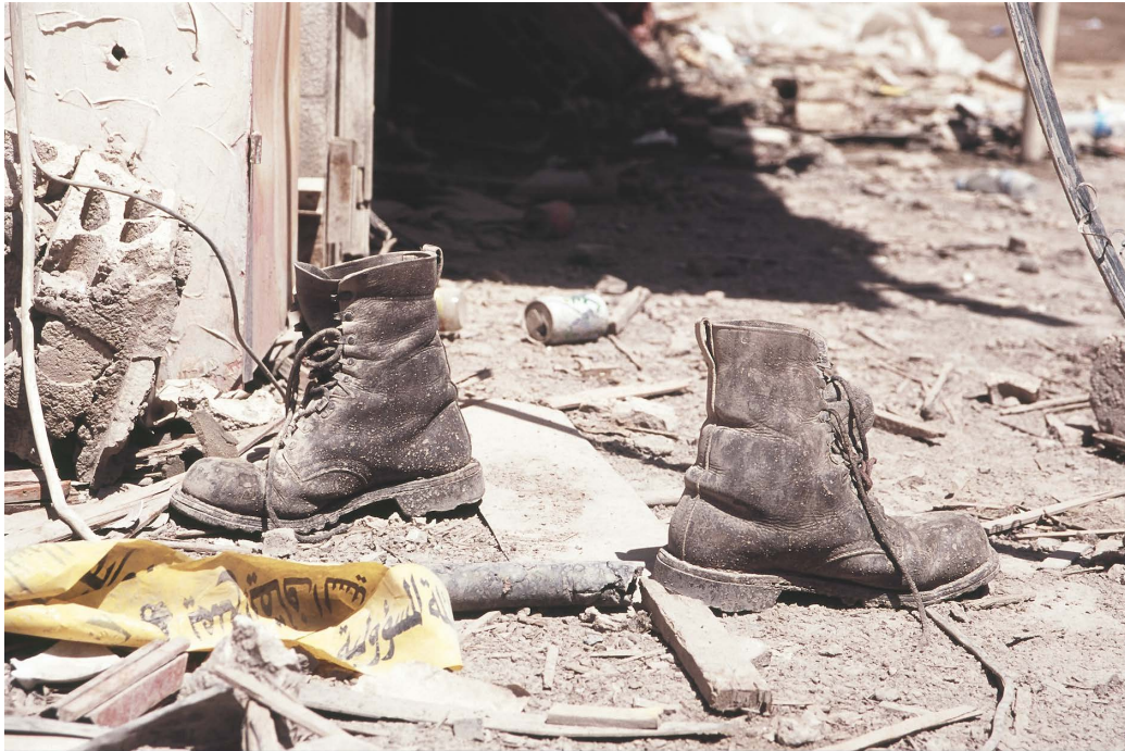
Disintegrated Objects by Caroline Tabet, POV Female Beirut

Beirut is a city that question us by its history, culture and identity... It was the perfect kind of city to work with.