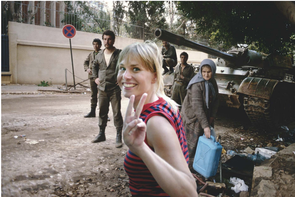
Parallel Universe & Beirutopia by Randa Mirza, POV Female Beirut

POV Female is a project based on individualities and personal expressions. All the series are connected by the unexpected and intimate vision of the photographer from different cities and continents.