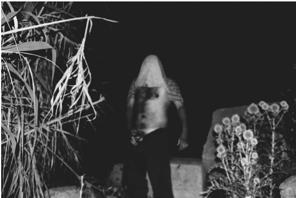
The Reeds by Lara Tabet, POV Female Beirut